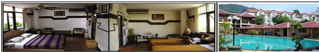
Kata Center Inn and Little Mermaid GH & Bungalows

Pick your own accommodation just 1-2 minutes walk to your IDC classroom at Calypso Dive Center. Price per room with a queen size bed, your own bathroom and shower, daily towel change and room cleaning (fan or aircon), per week starts from 1,800 THB (that's about 45.00 $US). Your hotel is just 1-2 minutes walk from your IDC classroom, restaurants, pharmacy, medical center, cafe, night market, and 5 minutes walk to beautiful Kata Beach! Just let us know your preference, single or double? We'll be happy to assist.