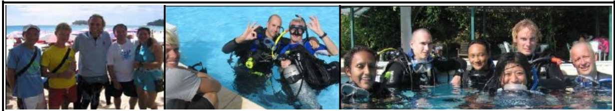
(L to R): 2006 – February, April, and January Successful IDC candidates

Early Online booking Bonus: 10 days free Single Accommodation for those who plan and book early with our IDC Comprehensive Package! All you need to do is pay your deposit (350.00 $US) online or via bank transfer, and we'll take care of your accommodation for 10 days. Your own room will have a queen size bed, your own bathroom and shower, daily room cleaning service, fan cooling or aircon (depending on availability), and within 2-3 minutes walk to your IDC classroom.